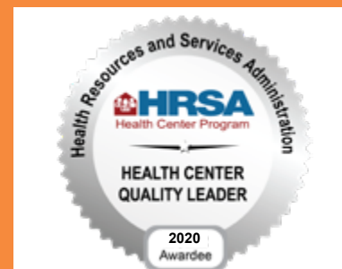
2020 HRSA Health Center Quality Leader