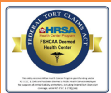
FTCA Deemed Facility

Mission Neighborhood Resource Center 165 Capp Street, San Francisco, CA 94110 ☎ (415) 869-7977